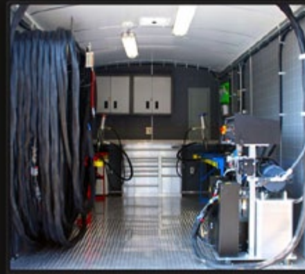
Gooseneck or 5 th wheel