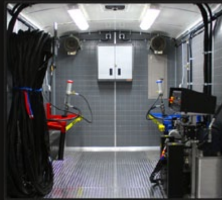
Tag along - bull-nose / V-nose