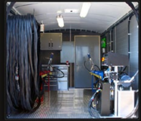
Custom Size Box Truck